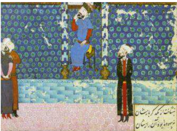
Figure 3. Lower part of the painting.

At the top of the main painting, dynamic elements such as animal, human, cloud, and bird exist compared to fixed elements such as big scarves, and shapes at the center of the paintings, that indicates dynamism of this section. The lower part consists of three elements of human, background, and the frame that contains the text. In this section, a man with a crown is sitting on a throne in the middle of the picture with his finger on his mouth and is looking up. Behind him and lower in the image, a person wearing a long robe is standing with crossed hands and is following the same look. On the lower left, two men with the same clothing as the man on the right are standing next to each other while one of them has clenched his hands and the other has his hands on his shoulder and looking up.