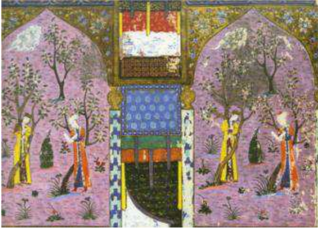
Figure 2. Upper part of the painting.

flying bird would ends at the foot of the man holding a book and the foot of the woman dressed in yellow reaches the upward flying bird. In theosophy, yellow is the symbol of wisdom and, as was mentioned before, the upward and downward arches are pointing to the ascending and descending bows.