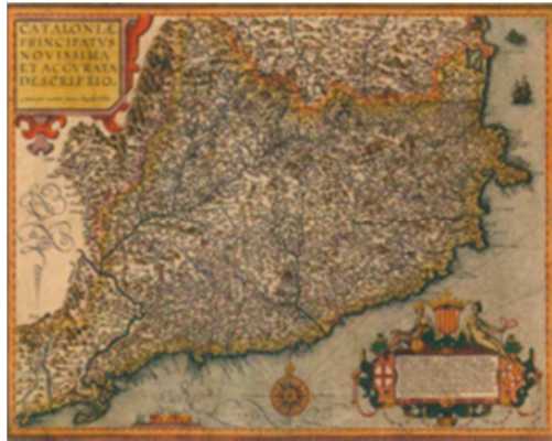
Figure 1. Map of Catalonia in 1608.

from most of the rest of Spain because of its ethnic uniqueness and its unique language and culture.” [1]