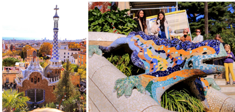
Figure 5. Güell Park.

“In Gaudí’s architecture, we can see that the mosaic art has departed from the traditional flat position and flat shape to become a part of three-dimensional sculpture.” [6] One of the most characteristic and attractive is the Park Güell (Figure 5), which was built in 1900-1914 on the slopes of the Peralda Hill in northeastern Barcelona, Spain, covering an area of 20 hectares. Today, the park is packed with visitors every day and has become one of the most important national cards in Barcelona.