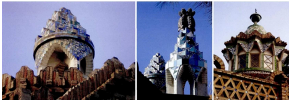
Figure 4. Ceramic mosaic on the roof and walls of the Güell Public House.

modern materials to show a mixture of old and new in architecture; the use of ceramic materials is not new, but as far as the use of ceramics is concerned, Gaudí had a new approach, and his research process was serendipitous. “His first use of ‘ trencadis ’ was in the work of the Güell House, whose subtle, complex, highly naturalistic architecture simply could not be decorated with squared-off squares for the details, and he eventually came up with the solution of breaking before standing, that is, breaking the ceramic tiles and then pieced together and used in the seemingly varied details he created,” [3] and thus by accident, Gaudí created the art of ceramic mosaics, using ceramics of varying shapes and brilliant colors to cover his buildings (Figure 4).