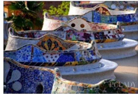
Figure 7. Swivel-back bench.

this case, the use of ceramic mosaic for decoration can best improve the details of the building, ceramic mosaic can fit well with the zigzag form of the building so as to optimize the architectural details, at the same time, ceramic mosaic glaze color contrast, fun and vividness, its composition pattern is also varied and With the implied meaning. "The architectural decorative techniques used by Gaudi expanded the artistic expression of the decorative language, with ceramic mosaics becoming a common element in the composition of buildings." [10]