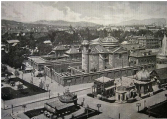
Figure 2. Expo Barcelona 1888.

At the beginning of the 18th century, the Spanish ruler, Philip V of Bourbon, abolished the autonomous government of Catalonia and banned the use of the Catalan language. Over the next hundred years, Catalan culture collapsed, and it