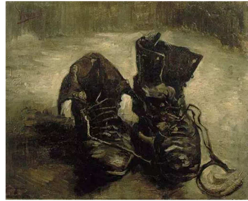
Figure 1. Peasant Shoes (painted by Van Gogh).

Figurative painting, also known as realistic painting, is a longstanding tradition in European art that emphasizes the use of perspective and anatomy as its foundational disciplines. To be precise, the work Peasant Shoes is a visually realistic representation that he obtained on-site by Van Gogh in a specific field, using a specific perspective and lighting conditions. [5]