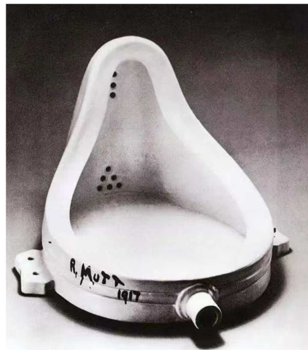
Figure 3. The Urinal (placed in an exhibition hall by Marcel Duchamp).

In 1917, Duchamp famously placed a urinal in an exhibition hall (see figure 3), which elevated the ordinary object to the status of a work of art as a ready-made product. This event marked the emergence of ready-made art as a significant category in contemporary art. As a result, not only did objects in figurative paintings come to life outside of the canvas, but objects used in paintings as collages also became independent of the paintings themselves, allowing objects to enter the world of art directly.